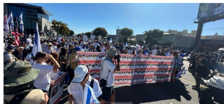
Thousands marched in Los Angeles, California on Sunday in solidarity with Israel and the Jewish people.