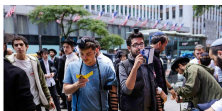
Hundreds put on Tefillin at the New York rally for Israel.