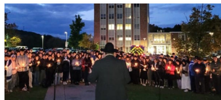
Chabad at Binghamton, Campus Rally for Israel