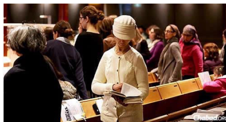
Hundreds participated in a prayer gathering and completed mitzvah cards in Sydney, Australia.

Countless people, many of whom do not regularly practice, have responded to these campaigns expelling much darkness and bringing blessing to the people of Israel. Chabad in Israel has launched a huge humanitarian effort offering physical and emotional assistance, spearheaded by the over 1000 Chabad Centers in communities throughout Israel. Shown below is a selection of the many pictures of the Jewish unity gatherings and Mitzvah campaigns that have reached us from far and wide.