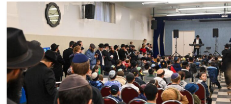
Montreal community gathers for children's rally in merit of Israel.