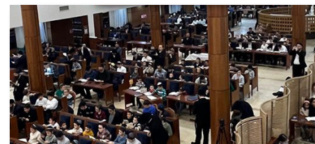
Hundreds gather in Moscow Shuls to pray for Israel.