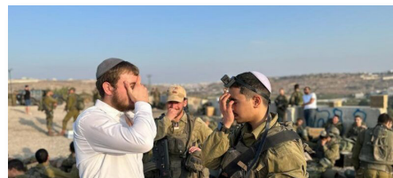
Chabad students arm IDF soldiers with Tefillin.