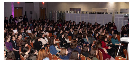
Over 5,000 Women Unite virtually and in person, in Prayer and Song for Israel.