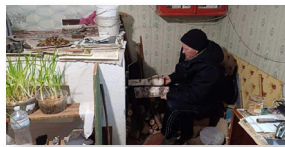
An elderly Jewish woman in Cherkassy loads a wood-burning kitchen stove.

Chabad centers have been distributing heaters, blankets, home insulation and food in cities and towns around the nation since the beginning of the war. With the sun going down in some places as early as 3:30 p.m., many residents are spending most of their days and nights in the dark and cold, while many others are spending more time at Chabad centers and public shelters.